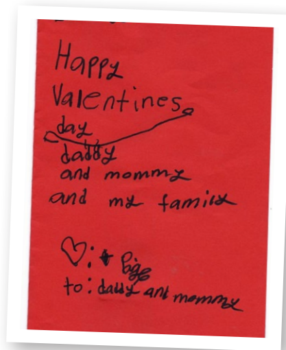
by a 6-year-old girl