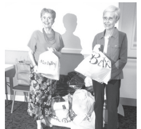
The Ingleglights of Ingleside Baptist Church collected hygiene items and presented them to the Dove Center during their monthly meeting.